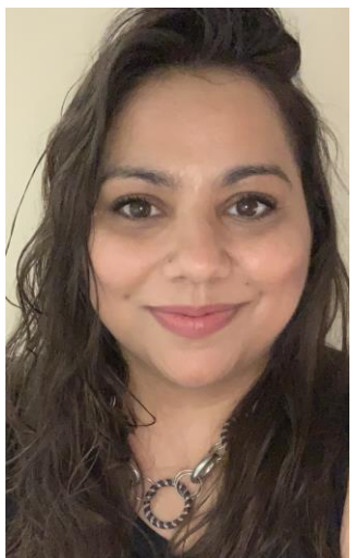
Early Years Leader and Classteacher