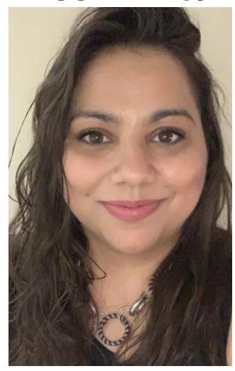
Early Years Leader and Classteacher