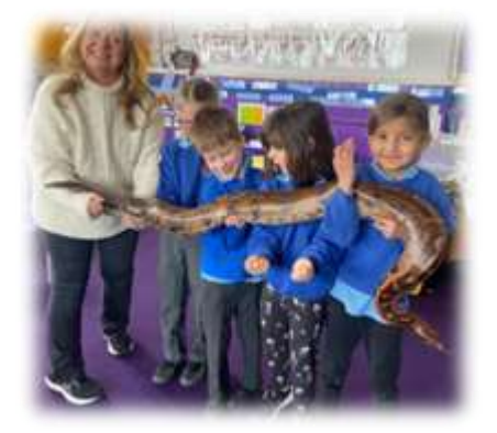
Animal Antics in Year One, as they enjoyed a number of special visitors as part of their Paws, Claws and Whiskers 'express' event. We have some brave children!